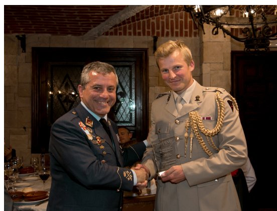
The prize ceremony of 2018, in Toledo, Spain